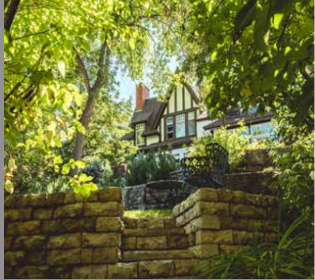
ABOVE / ORIGINAL SANDSTONE TIERED BACKYARD

When it's your turn to buy or sell property, please consider using us CharlesRealEstate.ca